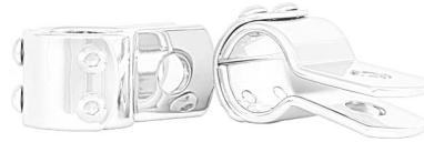
Pair of 1-1/4" Handlebar Clamps