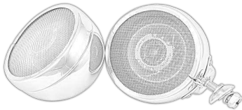
4" or 5.25" Kicker Speakers in Chrome or Black Finish